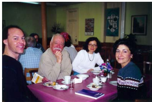
Enjoying a break from our hectic lives

"Another amazing experience. Made more great friends, ate too much great food! Hope to be back next year!"