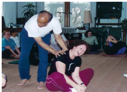
Rolling release to better health