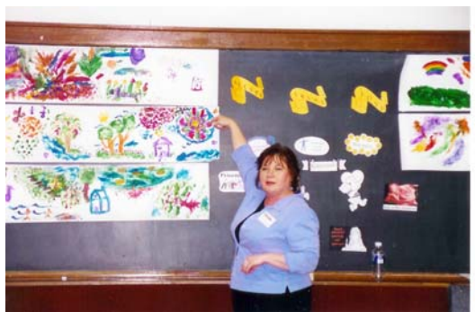
Breaking inner barriers through art